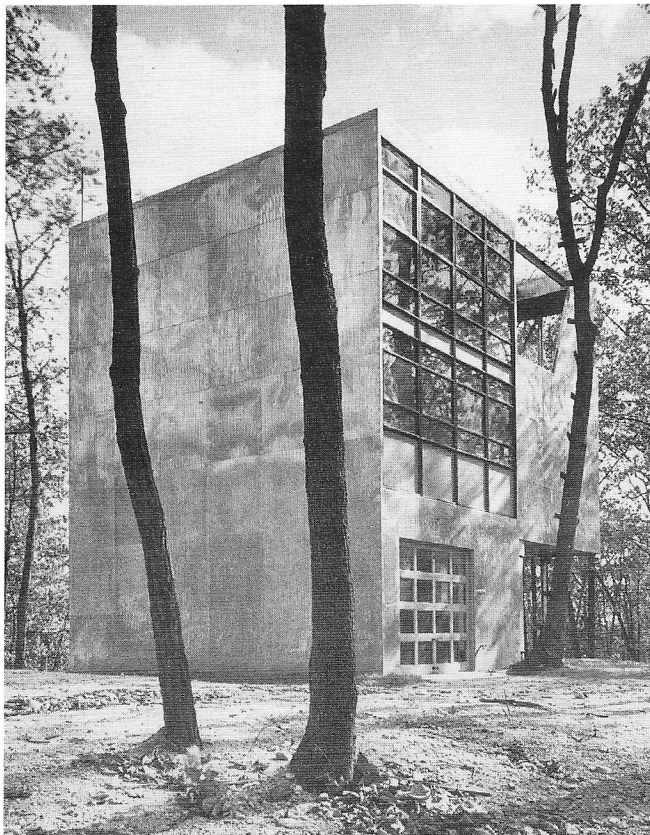
24. View of northwest corner